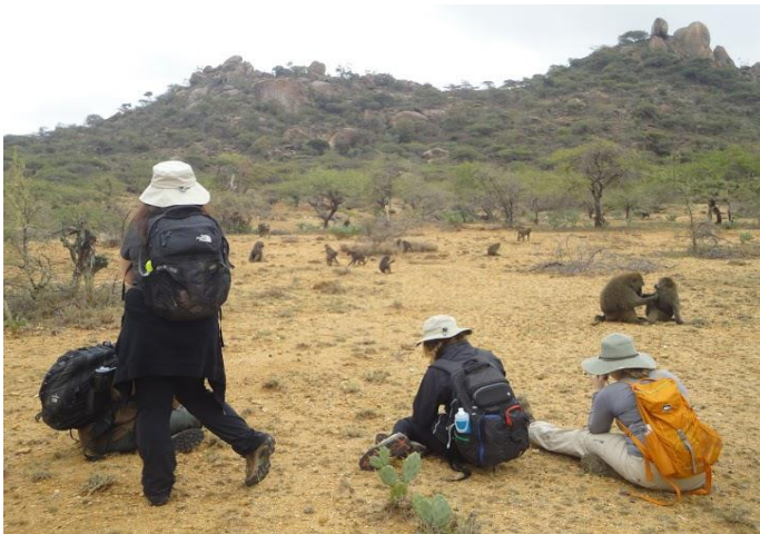
Baboon behavioral Data collection

- Best practices for data collection by field research assistants : Research assistants play a vital role in data collection and they require an understanding of how best to collect accurate, consistent and replicable data.