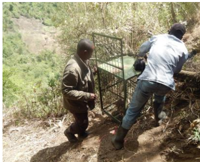
Preparing guereza capture cage