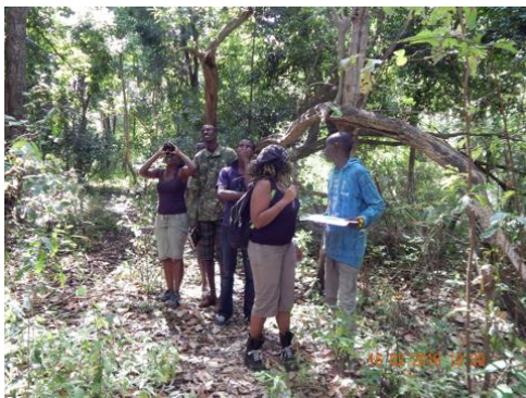
Vervet monkey behavioral data collection

- Ololua Nature Trail Walk and a tour of the primates holding facility at the Institute of Primate Research.